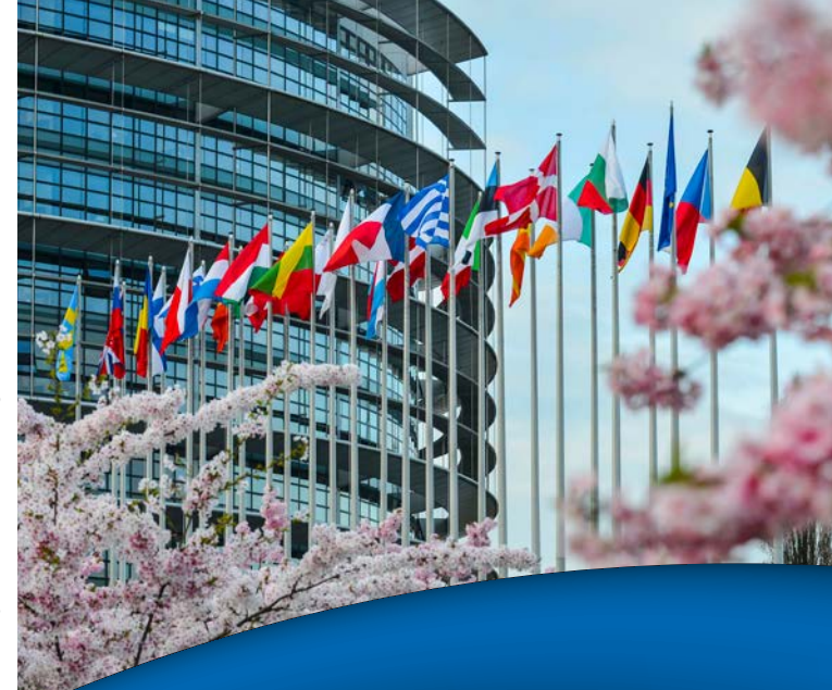
Photo: carer - © European Union 2013 - EP Louise Weiss Building - © Architecture Studio

ЕВРОПЕЙСКИ ПАРЛАМЕНТ PARLAMENTO EUROPEO EVROPSKY PARLAMENT EUROPA-PARLAMENTET EUROPAISCHES PARLAMENT EUROOPA PARLAMENT ΕΥΡΩΠΑΪΚΟ ΚΟΙΝΟΒΟΥΛΙΟ EUROPEAN PARLIAMENT PARLEMENT EUROPÉEN PARLAIMINT NA HEORPA EUROPSKI PARLAMENT PARLAMENTO EUROPEO EIROPAS PARLaments EUROPOS PARLAMENTAS EURÓPAI PARLAMENT IL-PARLAMENT EWROPEW EUROPEES PARLEMENT PARLAMENT EUROPEJSKI PARLAMENTO EUROPEU PARLAMENTUL EUROPEAN EUROPSKY PARLAMENT EVROPSKI PARLAMENT EUROOPAN PARLAMENTTI EUROPA PARLAMENTET